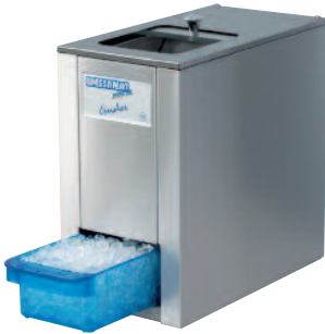
Ice crusher C 103 in classic gastronomy design with housing made of stainless steel and collection tray made of food-safe plastic

Space-saving devices for the production of real crushed ice made from ice cubes. The ideal companion for every ice maker if, in addition to ice cubes, also crushed ice is needed. By help of the integrated grinding mill the ice cubes are turned into crushed ice within seconds. For 3 kg to 5 kg crushed ice per minute. Available in glossy stainless steel, embossed stainless steel (colour anthracite) as well as with individual design.