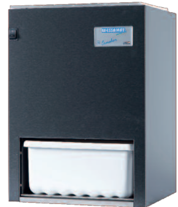
Ice crusher model CB 105 with housing made of embossed stainless steel (colour anthracite) and collection tray made of food-safe plastic