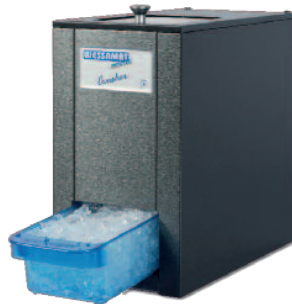
Ice crusher CB 103 with exclusive design housing made of embossed stainless steel (colour anthracite) and collection tray made of food-safe plastic