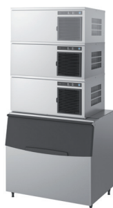
IM-240 DNE-HC - Basic model with top panel IM-240 XNE-HC - Stackable model with conveyor kit IM-240 XNE-HC - Stackable model with conveyor kit